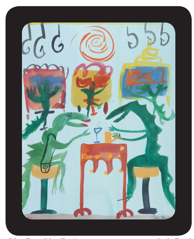
"Live Free, Live Fun"